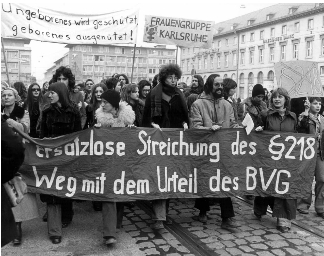
"Cancel § 218; Away with the Federal Constitutional Court's decision", 25 February 1975 in Karlsruhe / Germany

Since March 2023, a commission is to examine, among other issues, whether and how abortions could be regulated outside the criminal code. Its report is expected to be published in 2024. 5