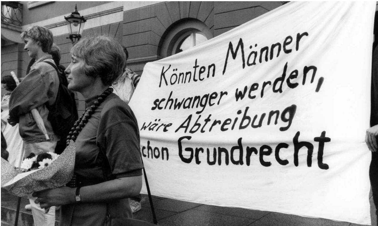
"If men could get pregnant, abortion would already be a basic right", 28 May 1993 in Karlsruhe / Germany