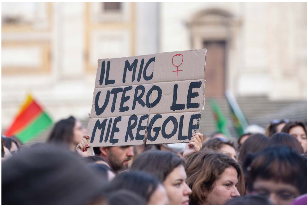
"My uterus, my rules", 28 September 2022 in Rome / Italy

Based on the aforementioned human rights, access to abortion is part of sexual and reproductive health and rights . These have been enshrined in international human rights since the United Nations World Population Conference in 1994. They relate to the realisation of a state of physical, mental, and social well-being in relation to all areas of human sexuality and reproduction. 39