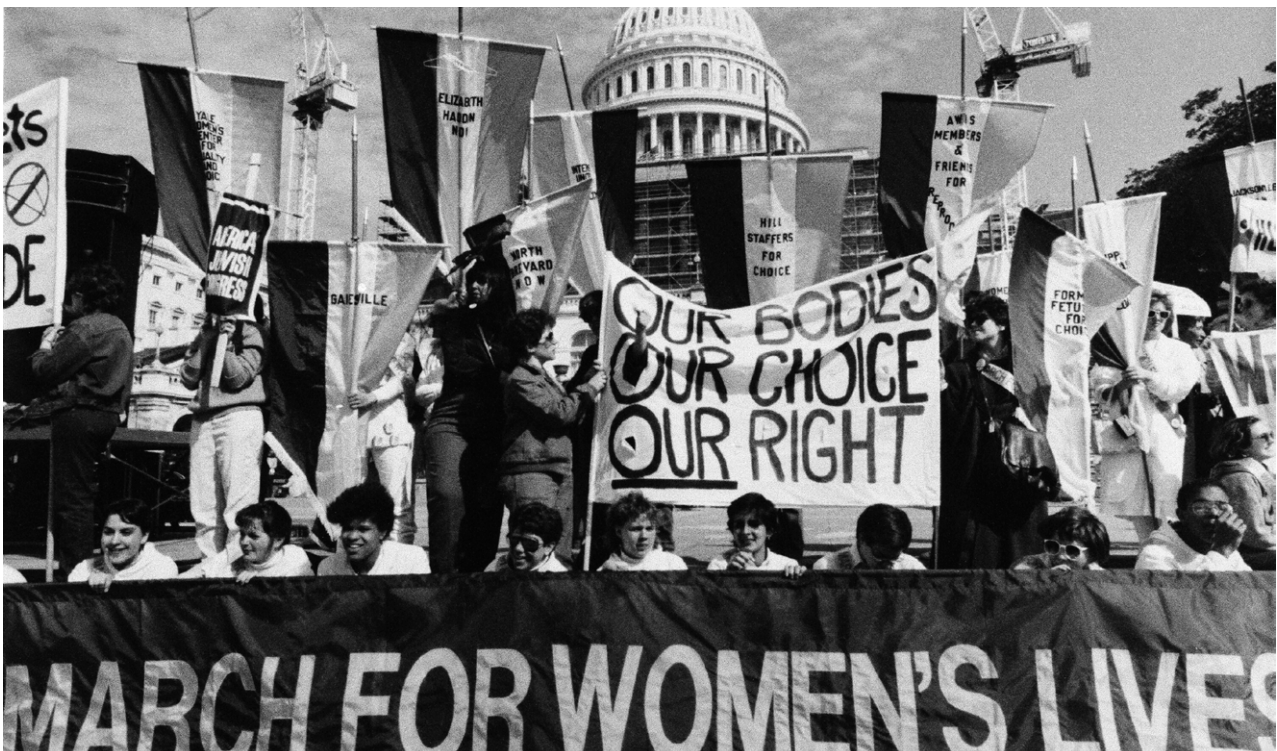
“Our bodies, our choice, our right”, 10 March 1986 in Washington / USA

At the same time, there is a push to restrict access to abortion drugs throughout the US. A final ruling regarding the mifepristone litigation is expected in 2024. 26