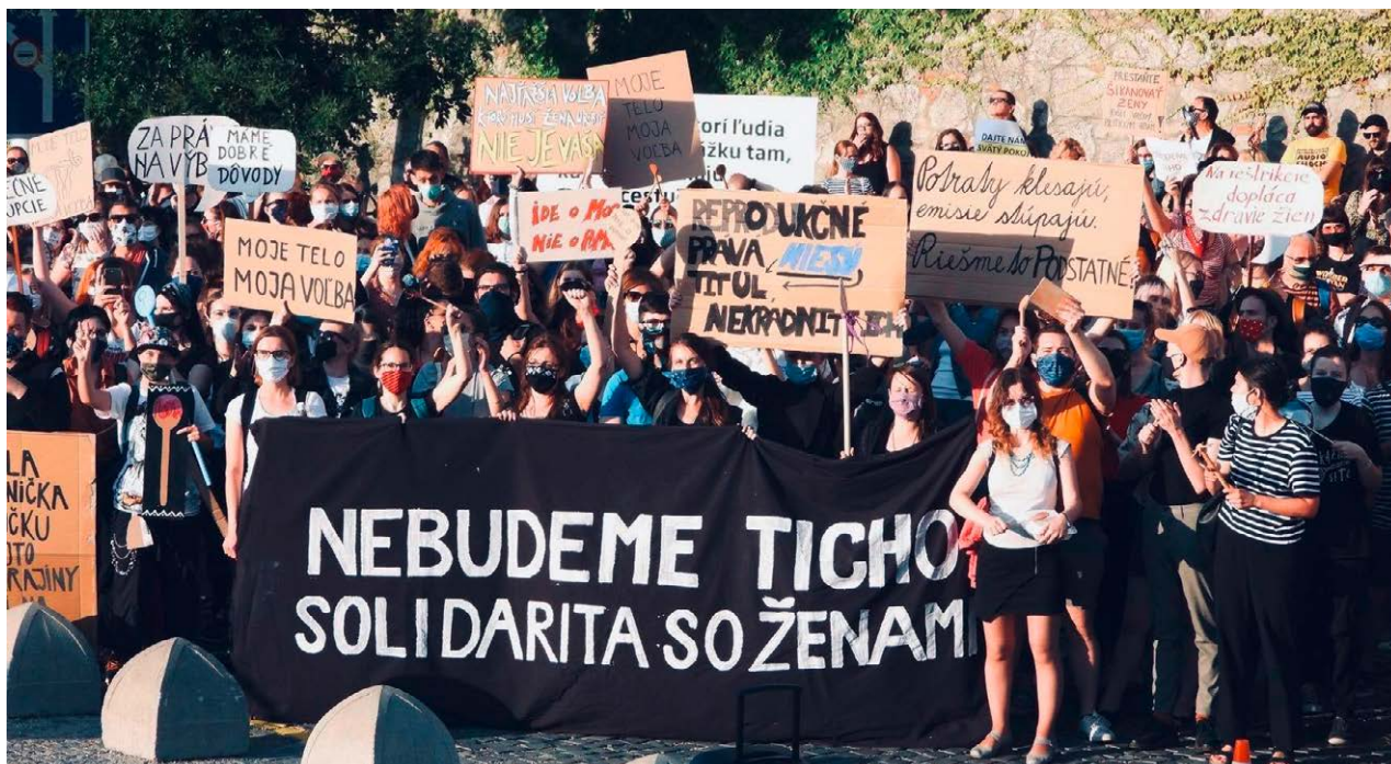
"My body, my rights", 7 July 2020 in Bratislava / Slovakia

The European Abortion Atlas ranks Slovakia among the worst countries in accessible and quality abortion care – 43rd out of 52. Freedom of Choice's own research confirms that abortion is hardly accessible and is rather a hurdle-race with many obstacles. These make it in some regions of the country and for many women in need impossible to access the procedure in time (12 weeks).