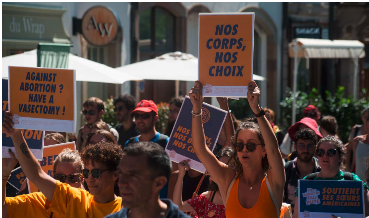
"Our body, our choice", 2 July 2022 in Strasbourg / France