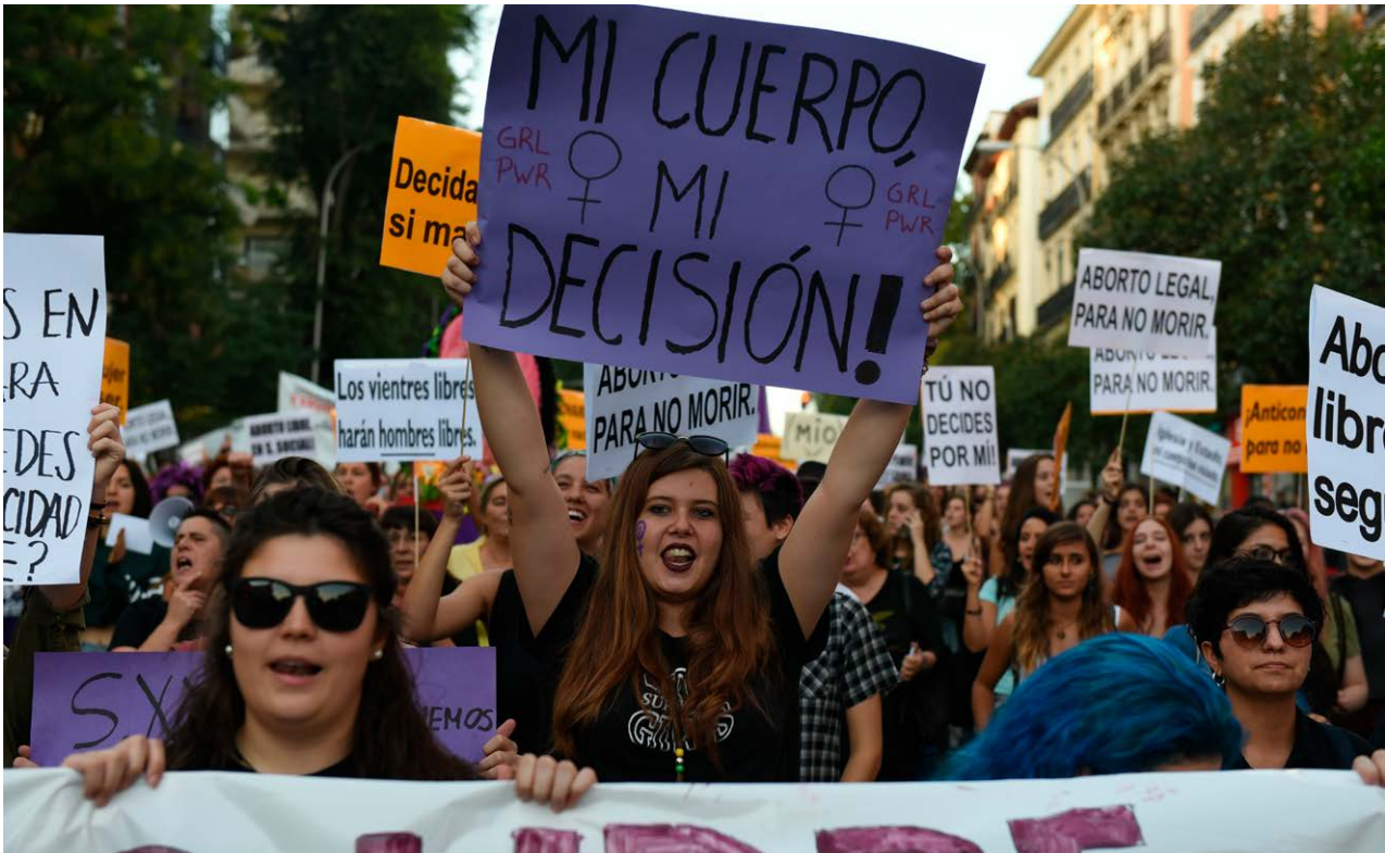
"My body, my decision", 28 September 2017 in Madrid / Spain

A look at the European picture shows very different situations in the individual countries as far as legal access to abortion is concerned. However, legalisation is rarely synonymous with quality care and good accessibility of safe abortion for all. This is partly due to the fact that social stigma continues to play a strong role. 6 In addition, there are regions within the European Union where further local or regional restrictions make it virtually impossible to access the right to an abortion, for instance in parts of Italy or Spain. 7 This is also linked to successful activities by opponents of abortion who are organised in transnationally active → anti-gender and → anti-abortion movements that campaign worldwide for a ban on abortion. However, these are in turn opposed by a large number of organisations and broad alliances of activists who campaign for the right to abortion throughout Europe.