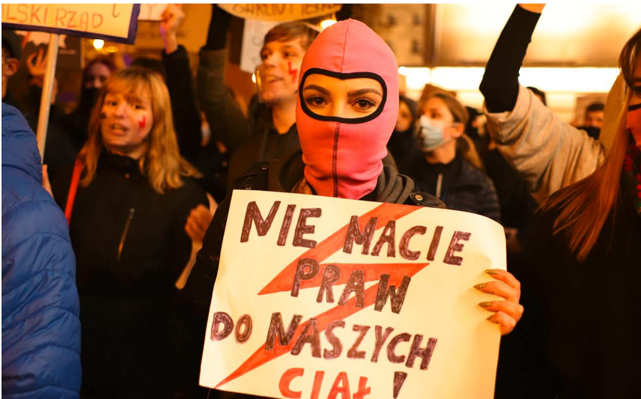
“You have no right to our bodies”, 25 October 2020 in Katowice / Poland

Very often do political parties give their MPs a free vote based on their “conscience” when it comes to the so called “cultural-ethical” proposals which target human rights like abortion access, LGBTQ* rights, etc. This approach has led to a shift from the traditional division on anti-abortion bills between Christians and traditionalists vs. progressives and liberals. There has been a worrying support (or at least lack of refusal) of such bills among some social democrats, who either vote for the proposals or choose to abstain.